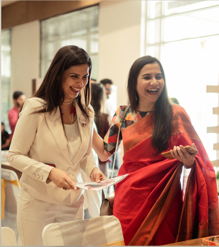
Image Management Professionals Association (IMPA) is the only association of Image Management Professional in the Indian Sub-Continent and Middle East.